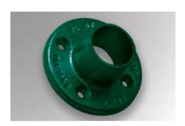
Wall Flange 561-7