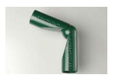
Variable Angle 554-7