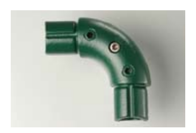
Split Elbow 515-7